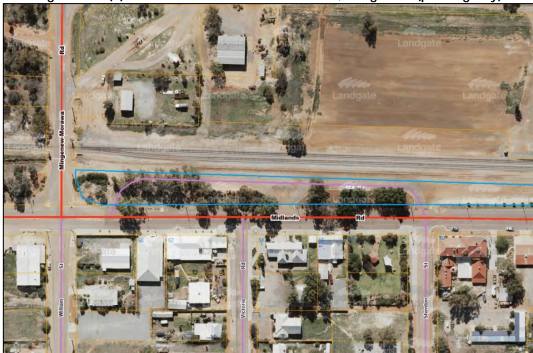
Figure 11.2(b) – Reserve 47995 Midlands Road, Mingenew (parking bay)

86 (Lot 50) Midlands Road, Mingenew is a 1,540m 2 property owned by Michael Ormesher that contains a former service station