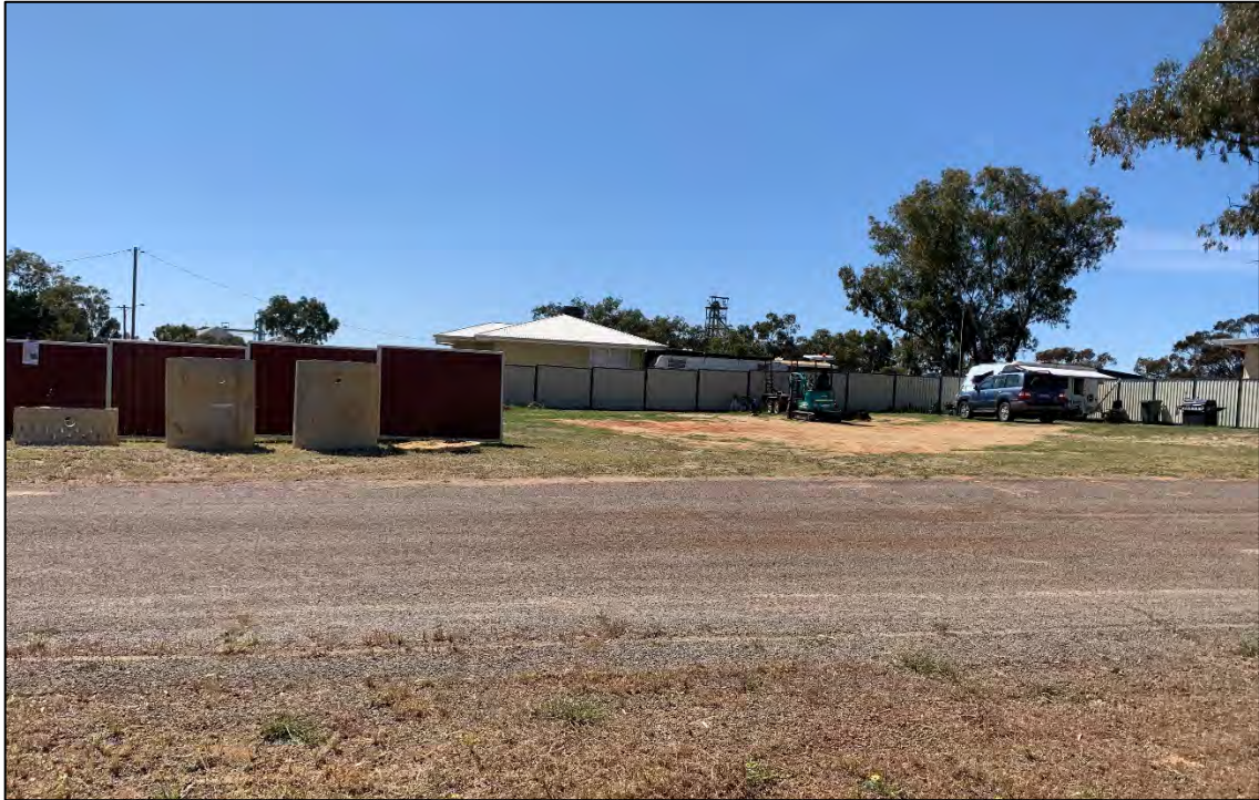
Figure 11.1(c) – View looking east at Lot 95 from Wattle Street

Council previously refused an application to construct a shed prior to a residence upon Lot 95 at its 19 June 2019 meeting.