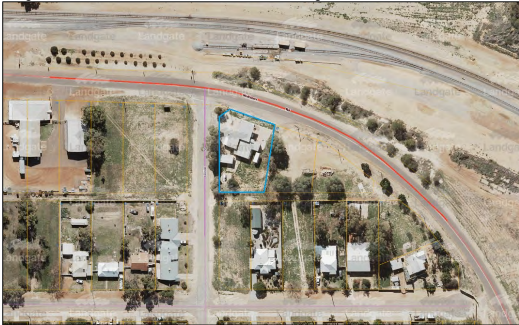
Figure 11.2(c) – 86 (Lot 50) Midlands Road, Mingenew (former service station)

Reserve 900 Coalseam Road, Holmwood (Coalseam Conservation Park) is a 753.8343ha Crown Reserve with a management order for 'Conservation Park' issued to the Department of Biodiversity, Conservation & Attractions.