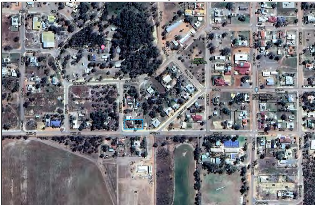
Figure 14.1(a) – Location Plan for 10 (Lot 137) Enanty Street, Mingenew

Lot 137 is a 1,133m 2 property on the corner of Enanty Street and Phillip Street.