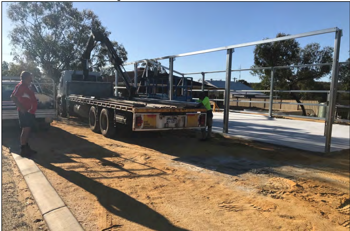
Figure 14.1(f) – View of Lot 137 looking east illustrating nil setback to Phillip Street