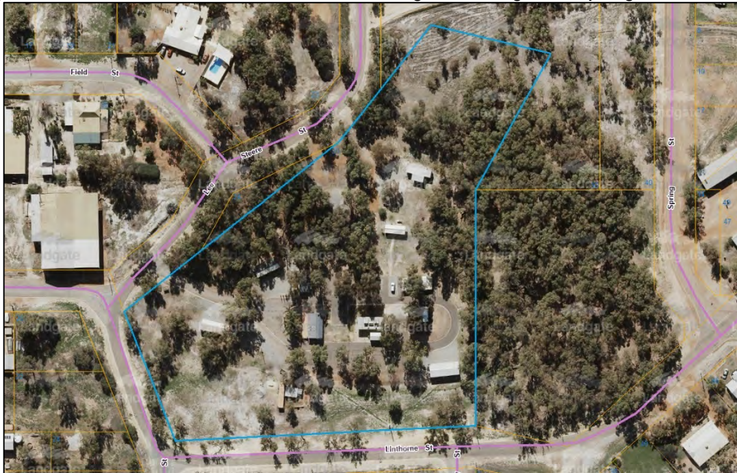
Figure 11.2(a) – 20 (Lot 267) Lee Steere Street, Mingenew (Mingenew Spring Caravan Park)

Reserve 47995 Midlands Road, Mingenew is a 2.3493ha Crown Reserve that contains a car parking area with a management order for 'Civic Purposes' issued to the Shire of Mingenew. The applicant is proposing to site the food & coffee van at this location only on Sunday afternoon when the Mingenew Bakery is closed for business.