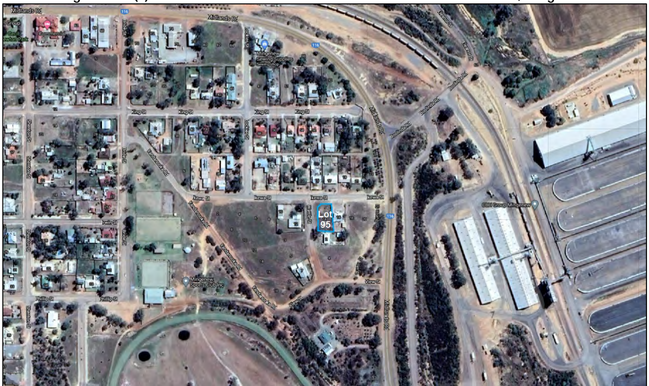
Figure 11.4(a) – Location Plan for Lot 95 corner Wattle & Ikewa Streets, Mingenew

Lot 95 is an 817m 2 property located on the south-east corner of the Wattle and Ikewa Street intersection.