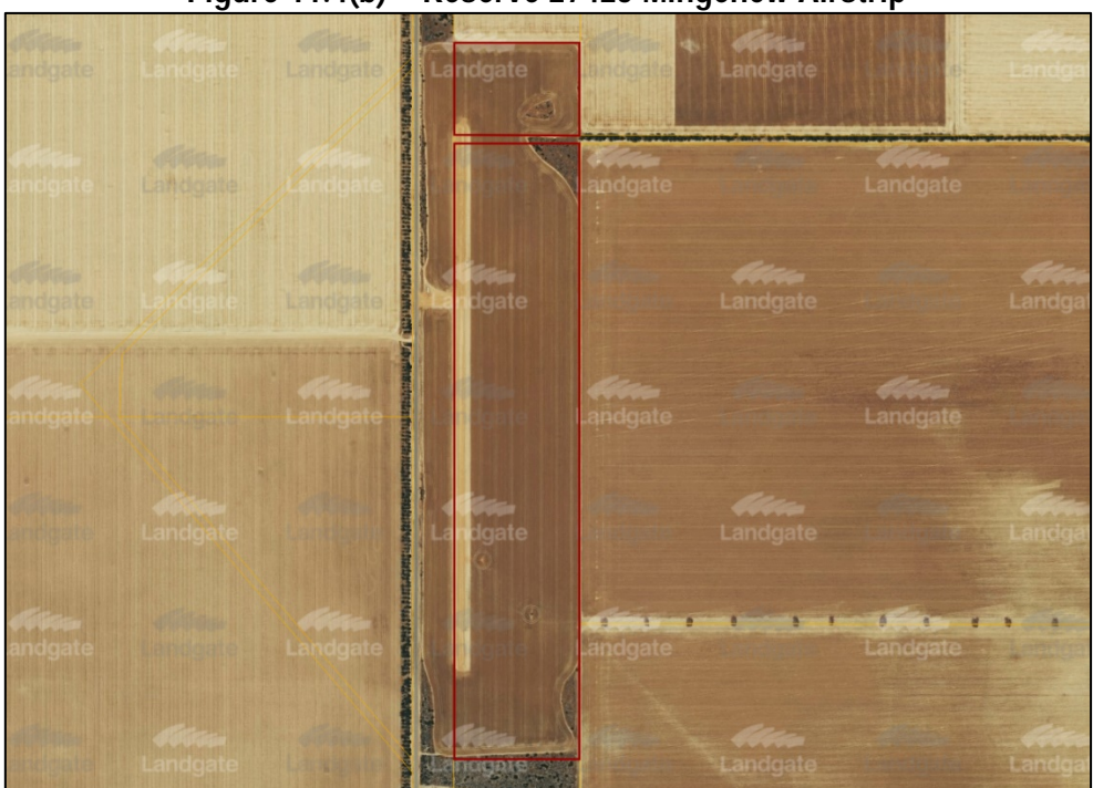
Figure 11.4(b) – Reserve 27425 Mingenew Airstrip

One area of concern for the Shire is that the North West Stock Route alignment being considered by the DPLH includes part of the airstrip infrastructure. The initially advertised alignment included Reserve 27425 i.e. the entire airstrip reserve (as shown in red outline in Figure 11.4(b) below). Following the Shire's correspondence Reserve 27425 has been removed by the DPLH. so that the alignment is now just the Mingenew South Road reserve. However this will still mean that any Shire (or other party) works between the airstrip and the carriageway will require referral to the DPLH.