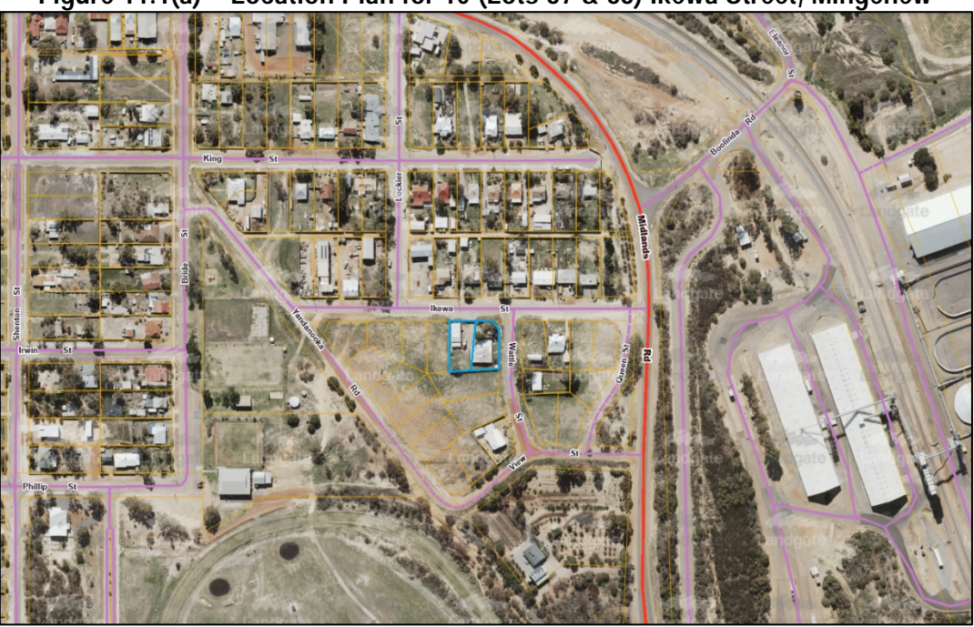
Figure 11.1(a) – Location Plan for 10 (Lots 87 & 88) Ikewa Street, Mingenew

Lot 87 is an 850m<sup>2</sup> property fronting Ikewa Street to the north that contained a 160m<sup>2</sup> outbuilding that was damaged by Cyclone Seroja. Lot 87 also contains a portion of the residence that is primarily located upon adjoining 847m<sup>2</sup> Lot 88 which is located on the corner of Ikewa and Wattle Streets.