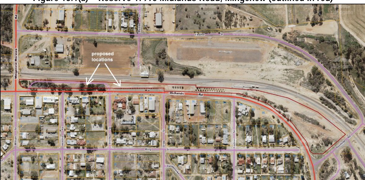
Figure 13.1(a) – Reserve 47995 Midlands Road, Mingenew (outlined in red)

Reserve 47995 Midlands Road, Mingenew is a 2.3493ha Crown Reserve that contains a car parking area with a management order for 'Civic Purposes' issued to the Shire of Mingenew. The applicant is proposing to site the ice cream van at 2 locations in this reserve, opposite the Mingenew Bakery and opposite the Mingenew Hotel.