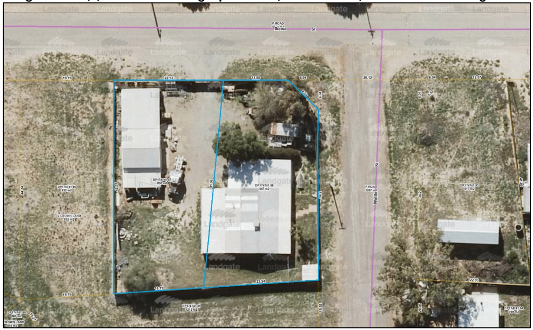
Figure 11.1(b) – Aerial Photograph of 10 (Lots 87 & 88) Ikewa Street, Mingenew

have buildings across boundaries and the oldest available Department of Lands aerial photography indicates that the built form upon Lots 87 & 88 has been in place since at least 1998, and it is suggested that the actual site development pre-dates this by some way.