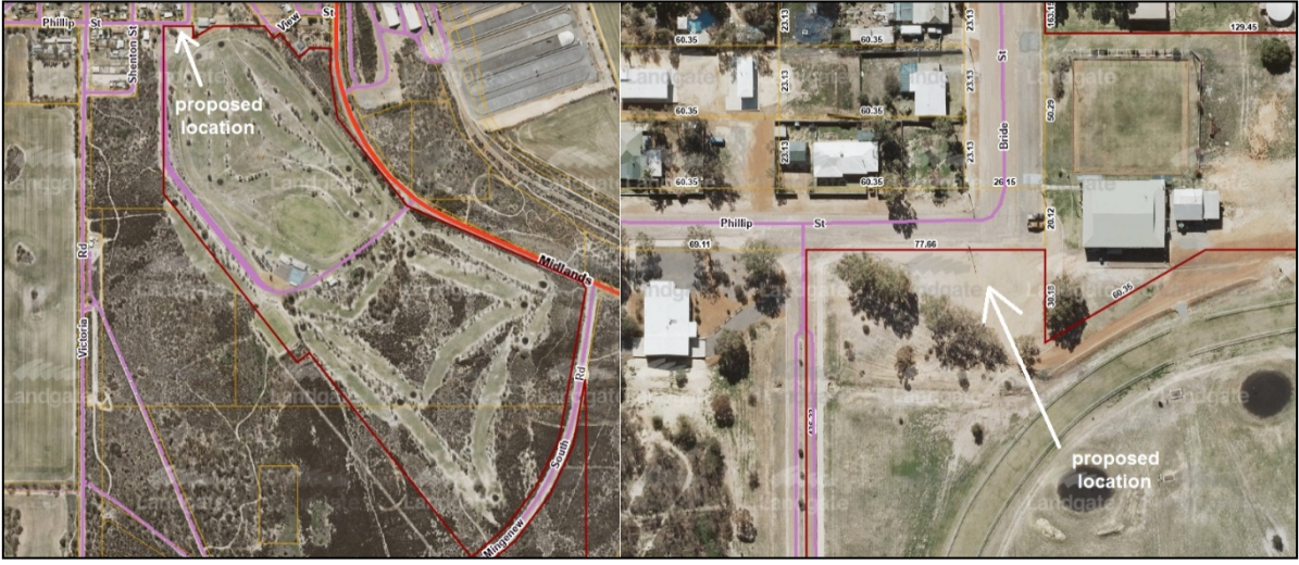
Figure 13.1(b) – Reserve 20735 Bride Street, Mingenew (outlined in red)

Reserve 20735 Bride Street, Mingenew is an 81.957ha Crown Reserve that contains the Mingenew Recreation Grounds and has a management order for 'Recreation, Racecourse, Showground & Aerial landing Ground' issued to the Shire of Mingenew. The applicant is proposing to site the ice cream van adjacent to Bowling Club car park.