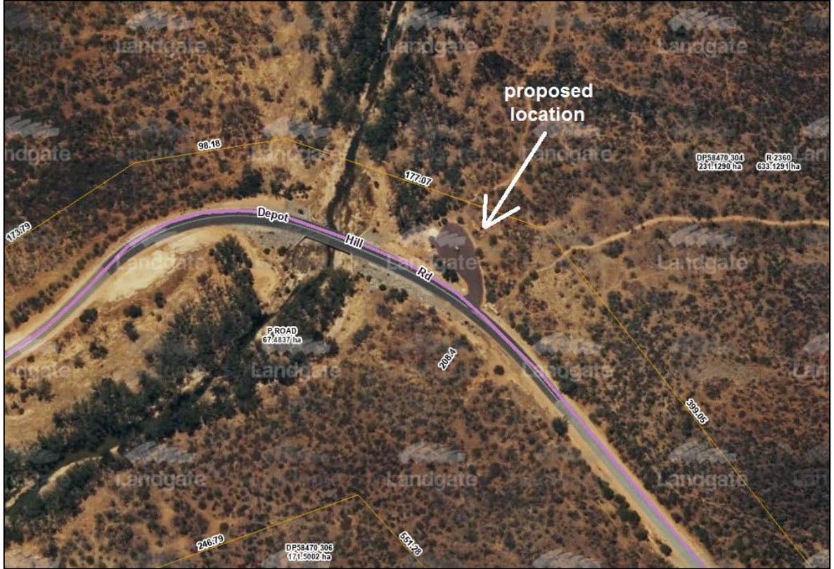
Figure 13.1(c) – Depot Hill Road Car Park

The Depot Hill Road car park is located within a Shire managed road reserve.